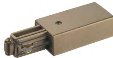
EINSPEISER FÜR 1 PHASEN HV-SCHIENE